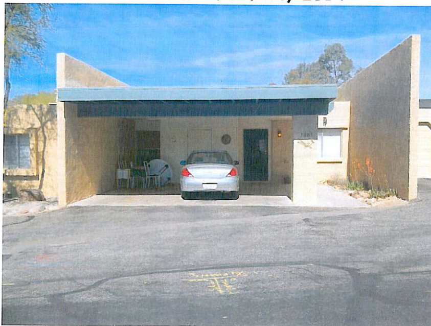
Left Side View - Feb. 14, 2014