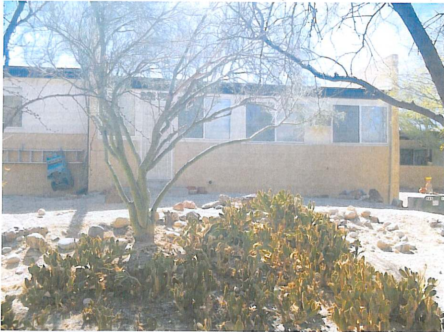
Right Side View - Feb. 14, 2014