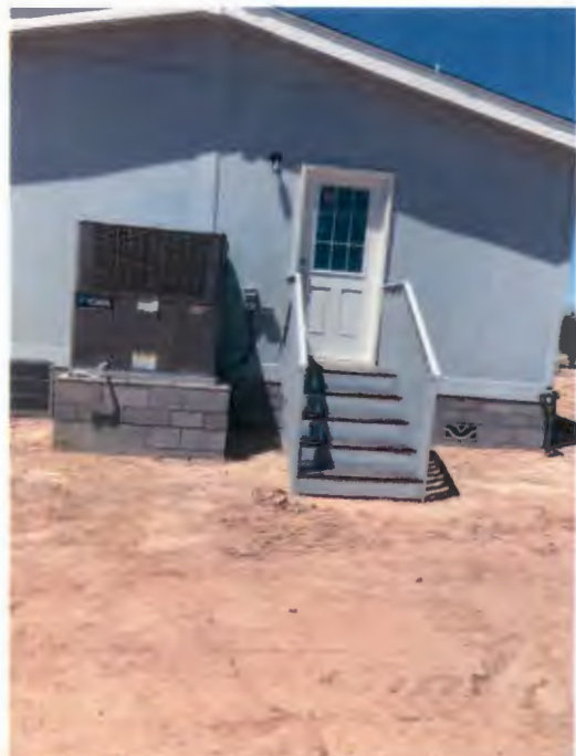
HEAT PUMP 5-10-2021