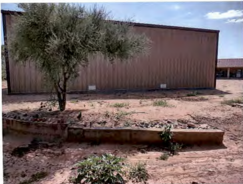
Looking Southwest 8/23/21