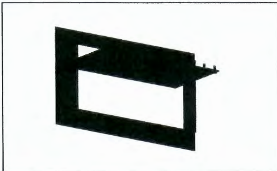
FIGURE 2—MODEL FFV-1608 FREEDOM FLOOD VENT™: SHOWN WITH FLOOD DOOR PIVOTED OPEN