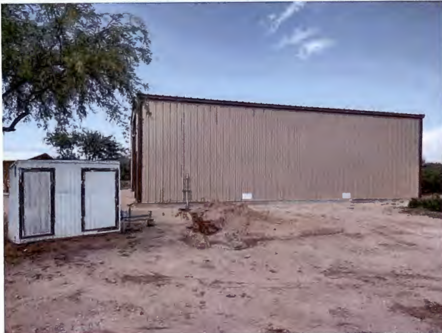
Looking North 8/23/21