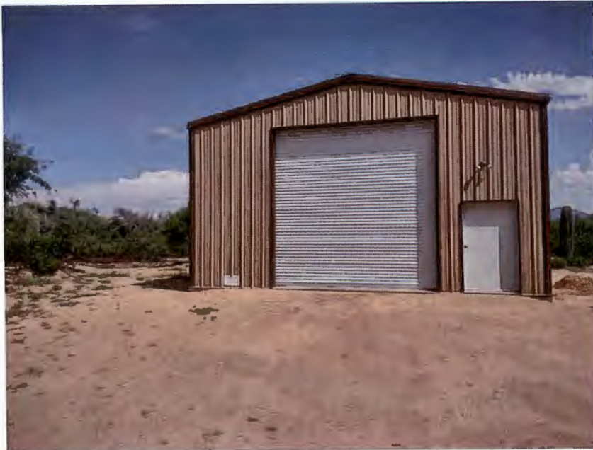
Looking Southeast 8/23/21

If using the Elevation Certificate to obtain NFIP flood insurance, affix at least 2 building photographs below according to the instructions for Item A6. Identify all photographs with date taken; "Front View" and "Rear View"; and, if required, "Right Side View" and "Left Side View." When applicable, photographs must show the foundation with representative examples of the flood openings or vents, as indicated in Section A8. If submitting more photographs than will fit on this page, use the Continuation Page.