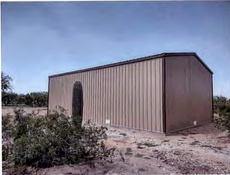
Looking Northwest 8/23/21

If submitting more photographs than will fit on the preceding page, affix the additional photographs below. Identify all photographs with: date taken; "Front View" and "Rear View"; and, if required, "Right Side View" and "Left Side View." When applicable, photographs must show the foundation with representative examples of the flood openings or vents, as indicated in Section A8.