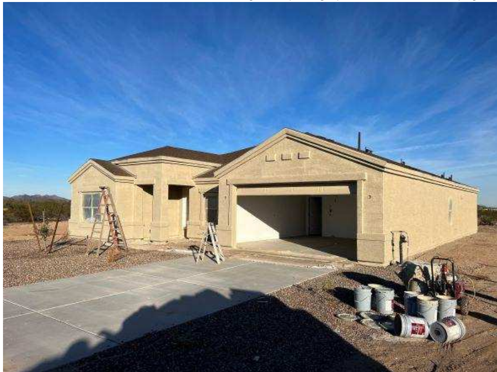
Photo One Caption View from SE property corner

If using the Elevation Certificate to obtain NFIP flood insurance, affix at least 2 building photographs below according to the instructions for Item A6. Identify all photographs with date taken; "Front View" and "Rear View"; and, if required, "Right Side View" and "Left Side View." When applicable, photographs must show the foundation with representative examples of the flood openings or vents, as indicated in Section A8. If submitting more photographs than will fit on this page, use the Continuation Page.