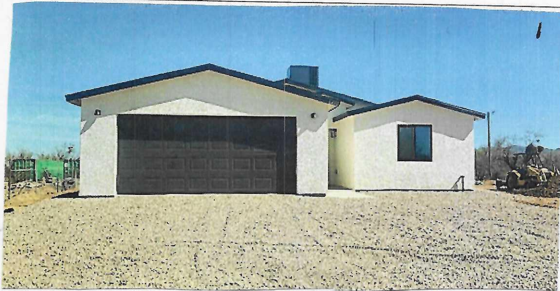
Front Side (So Side looking N.) 4/17/2025 Photo One

Instructions: Insert below at least two and when possible four photographs showing each side of the building (for example, may only be able to take front and back pictures of townhouses/rowhouses). Identify all photographs with the date taken and "Front View," "Rear View," "Right Side View," or "Left Side View." Photographs must show the foundation. When flood openings are present, include at least one close-up photograph of representative flood openings or vents, as indicated in Sections A8 and A9.