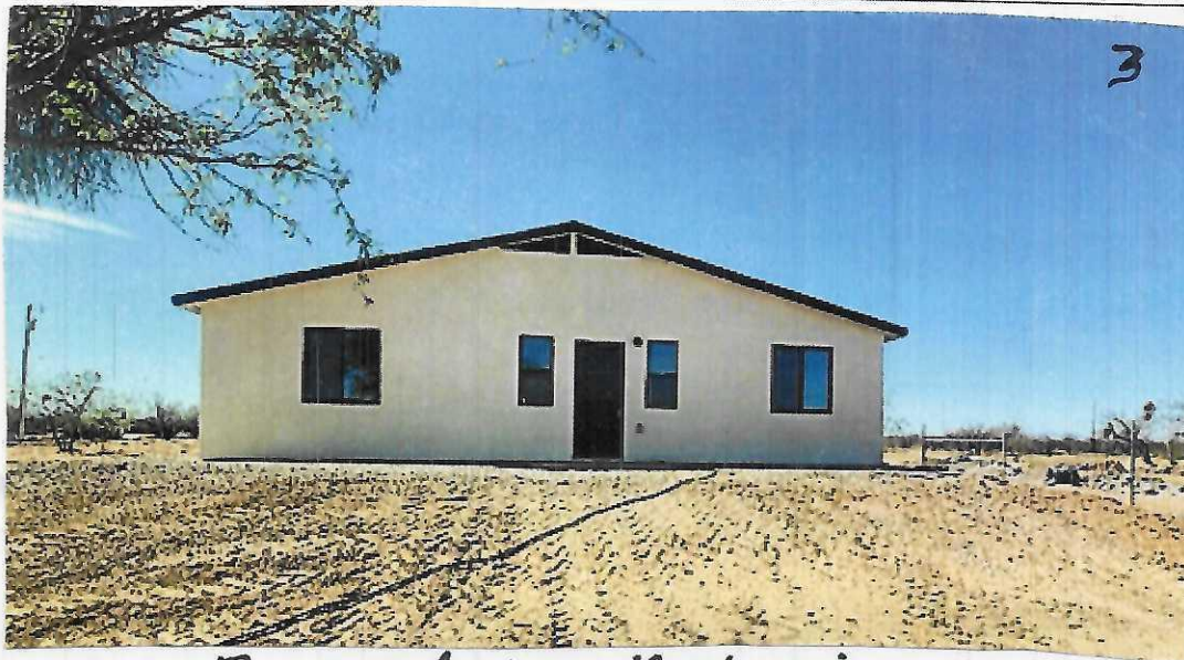
Back Side (N. Side looking So) 4/17/2025 Photo Three

Insert the third and fourth photographs below. Identify all photographs with the date taken and "Front View," "Rear View," "Right Side View," or "Left Side View." When flood openings are present, include at least one close-up photograph of representative flood openings or vents, as indicated in Sections A8 and A9.