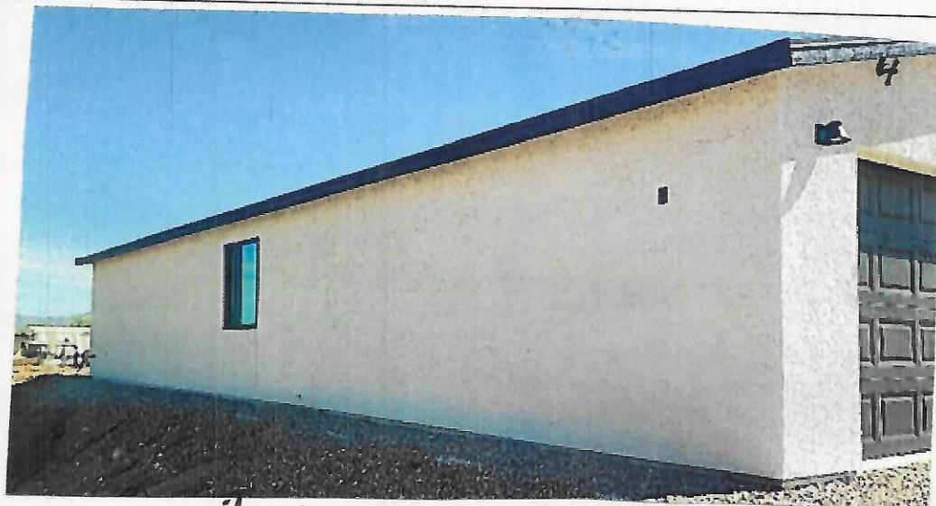
Lt Side (N. Side looking E.) 4/17/2025 Photo Four