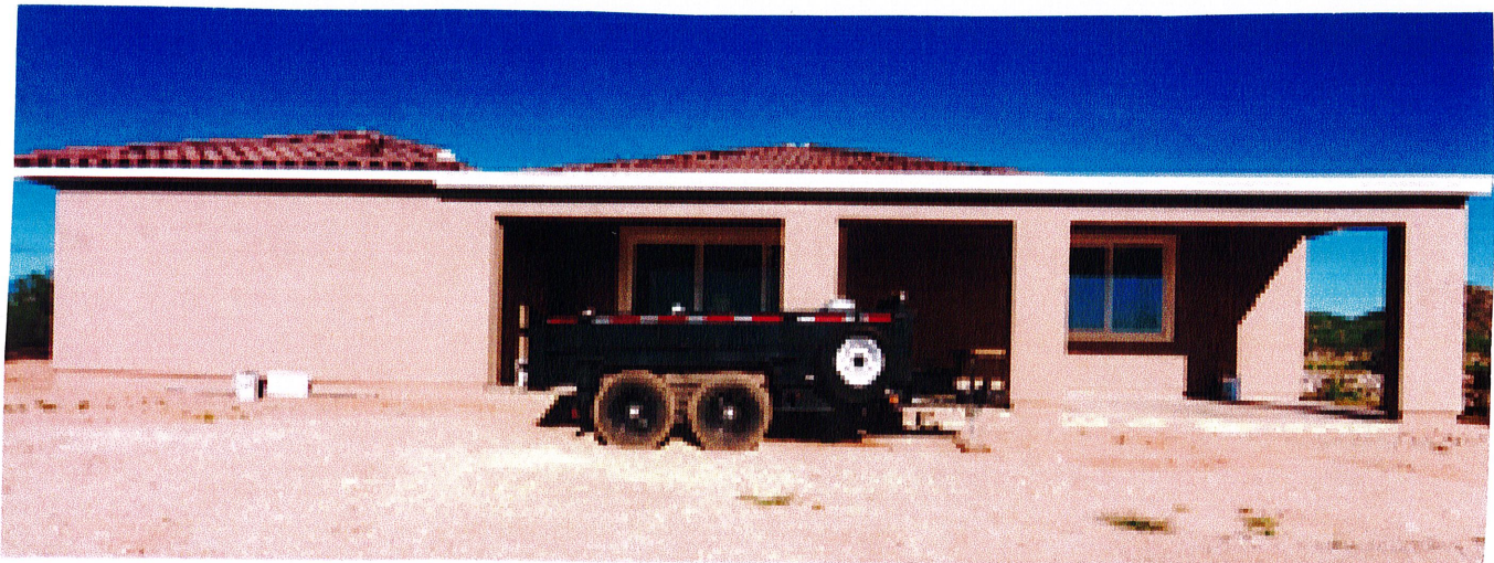
Back View (W. Side Looking East) 9/19/2022