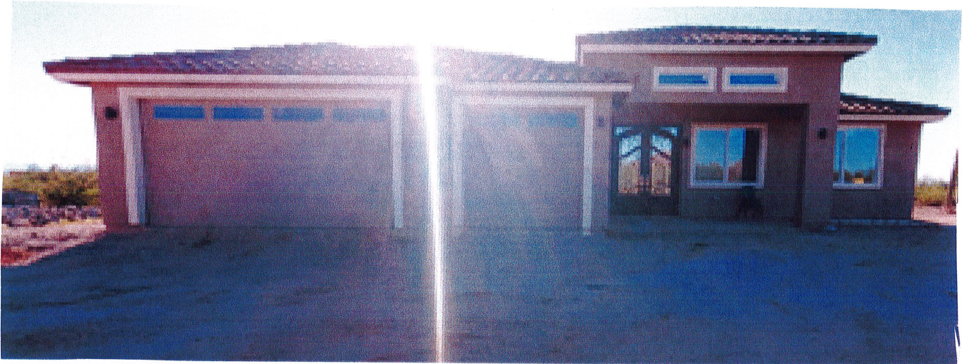
Front View (E. Side looking West) 9/19/2022

If using the Elevation Certificate to obtain NFIP flood insurance, affix at least 2 building photographs below according to the instructions for Item A6. Identify all photographs with date taken; "Front View" and "Rear View"; and, if required, "Right Side View" and "Left Side View." When applicable, photographs must show the foundation with representative examples of the flood openings or vents, as indicated in Section A8. If submitting more photographs than will fit on this page, use the Continuation Page.