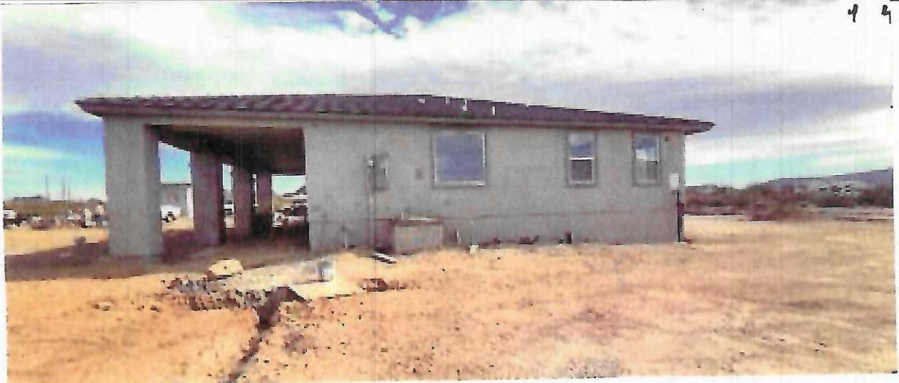
Left Side (W. Side looking E.) 1/25/2025