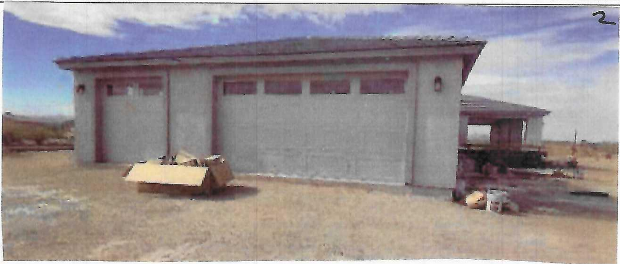
Right Side (E. Side looking W.) 1/25/2025 Photo Two