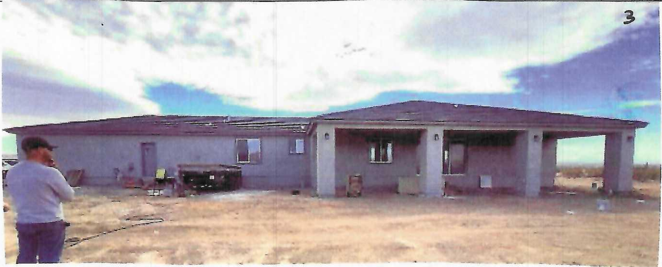
Back Side (N. Side looking So.) 1/25/2025

Insert the third and fourth photographs below. Identify all photographs with the date taken and "Front View," "Rear View," "Right Side View," or "Left Side View." When flood openings are present, include at least one close-up photograph of representative flood openings or vents, as indicated in Sections A8 and A9.