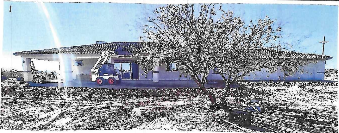
Front Face (E. Side looking West) 2/13/2024

Instructions: Insert below at least two and when possible four photographs showing each side of the building (for example, may only be able to take front and back pictures of townhouses/rowhouses). Identify all photographs with the date taken and "Front View," "Rear View," "Right Side View," or "Left Side View." Photographs must show the foundation. When flood openings are present, include at least one close-up photograph of representative flood openings or vents, as indicated in Sections A8 and A9.