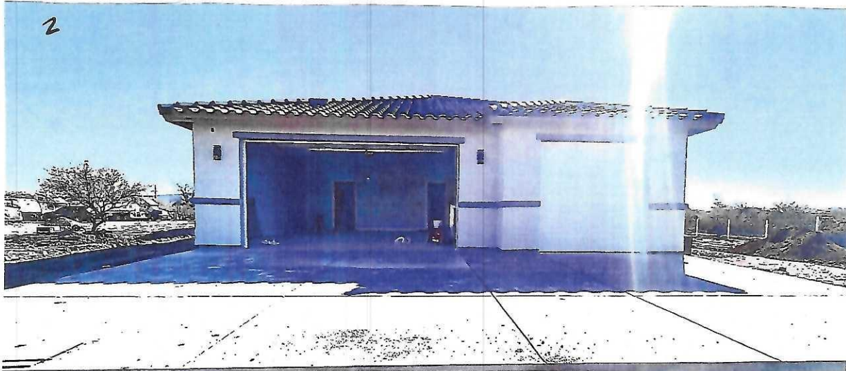
Right Face (N. Side looking So.) 2/13/2024