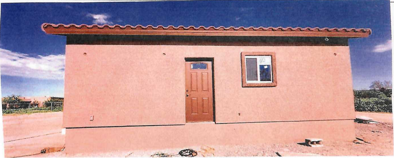
Right Side (W. Side looking E.) 8/11/2024

Insert the third and fourth photographs below. Identify all photographs with the date taken and "Front View," "Rear View," "Right Side View," or "Left Side View." When flood openings are present, include at least one close-up photograph of representative flood openings or vents, as indicated in Sections A8 and A9.