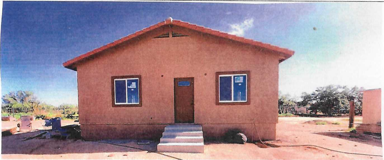
Front Side (N. Side looking So.) 8/11/2024 Photo One

Instructions: Insert below at least two and when possible four photographs showing each side of the building (for example, may only be able to take front and back pictures of townhouses/rowhouses). Identify all photographs with the date taken and "Front View," "Rear View," "Right Side View," or "Left Side View." Photographs must show the foundation. When flood openings are present, include at least one close-up photograph of representative flood openings or vents, as indicated in Sections A8 and A9.