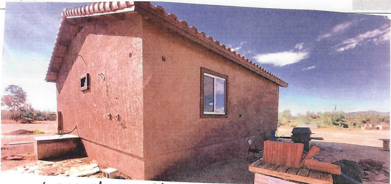
Left Side (E. Side looking W) 8/11/2024