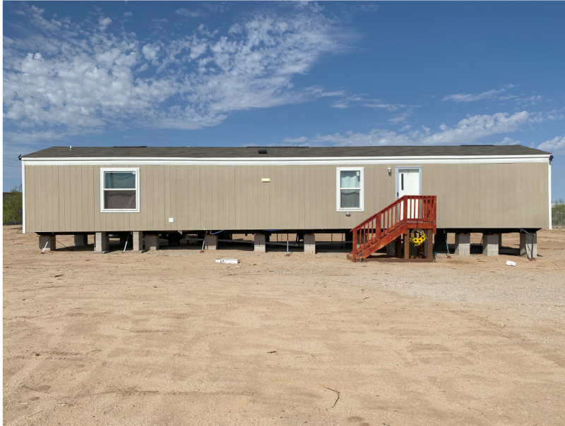
Front/East View – Taken August 7, 2023

Instructions: Insert below at least two and when possible four photographs showing each side of the building (for example, may only be able to take front and back pictures of townhouses/rowhouses). Identify all photographs with the date taken and "Front View," "Rear View," "Right Side View," or "Left Side View." Photographs must show the foundation. When flood openings are present, include at least one close-up photograph of representative flood openings or vents, as indicated in Sections A8 and A9.