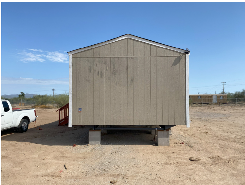
Left/South Side View – Taken August 7, 2023