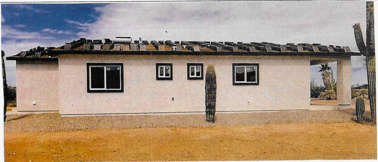
Left Side (E. Side Looking W.) 6/26/2024