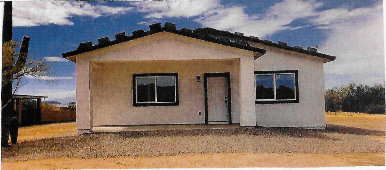
Front Side (N. Side looking So.) 6/26/2024

Instructions: Insert below at least two and when possible four photographs showing each side of the building (for example, may only be able to take front and back pictures of townhouses/rowhouses). Identify all photographs with the date taken and "Front View," "Rear View," "Right Side View," or "Left Side View." Photographs must show the foundation. When flood openings are present, include at least one close-up photograph of representative flood openings or vents, as indicated in Sections A8 and A9.