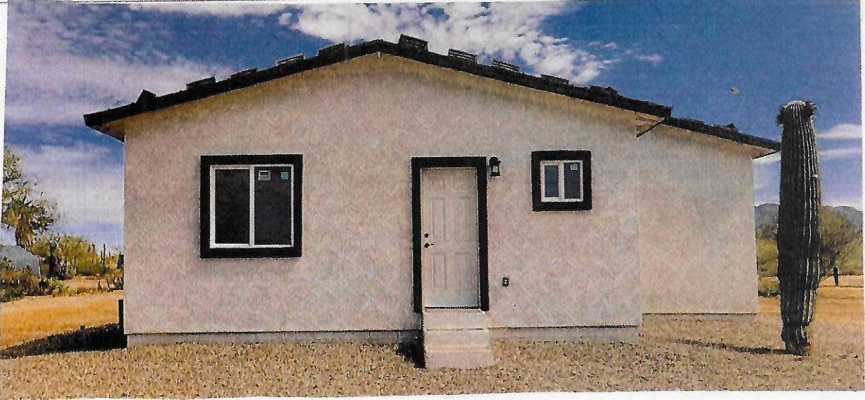
Back Side (So. Side looking N.) 6/26/2024

Insert the third and fourth photographs below. Identify all photographs with the date taken and "Front View," "Rear View," "Right Side View," or "Left Side View." When flood openings are present, include at least one close-up photograph of representative flood openings or vents, as indicated in Sections A8 and A9.