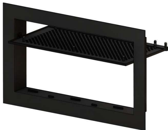
FIGURE 2—MODEL FFV-1608 FREEDOM FLOOD VENT®: SHOWN WITH FLOOD DOOR PIVOTED OPEN