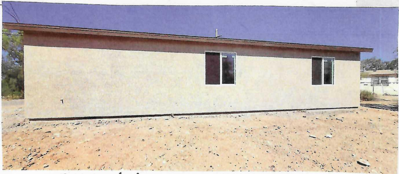
Right Side (E. Side looking West) 9/4/2024 Photo Two