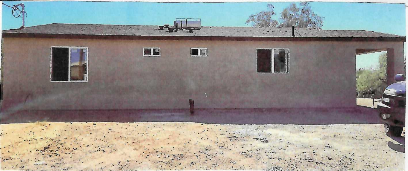
Left Side (W. side looking E.) 9/4/2024