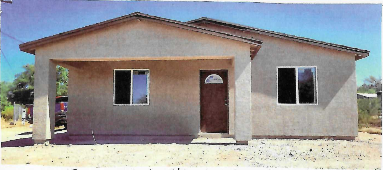
Front Side (So. Side Looking N.) 9/10/2024 Photo One

Instructions: Insert below at least two and when possible four photographs showing each side of the building (for example, may only be able to take front and back pictures of townhouses/rowhouses). Identify all photographs with the date taken and "Front View," "Rear View," "Right Side View," or "Left Side View." Photographs must show the foundation. When flood openings are present, include at least one close-up photograph of representative flood openings or vents, as indicated in Sections A8 and A9.