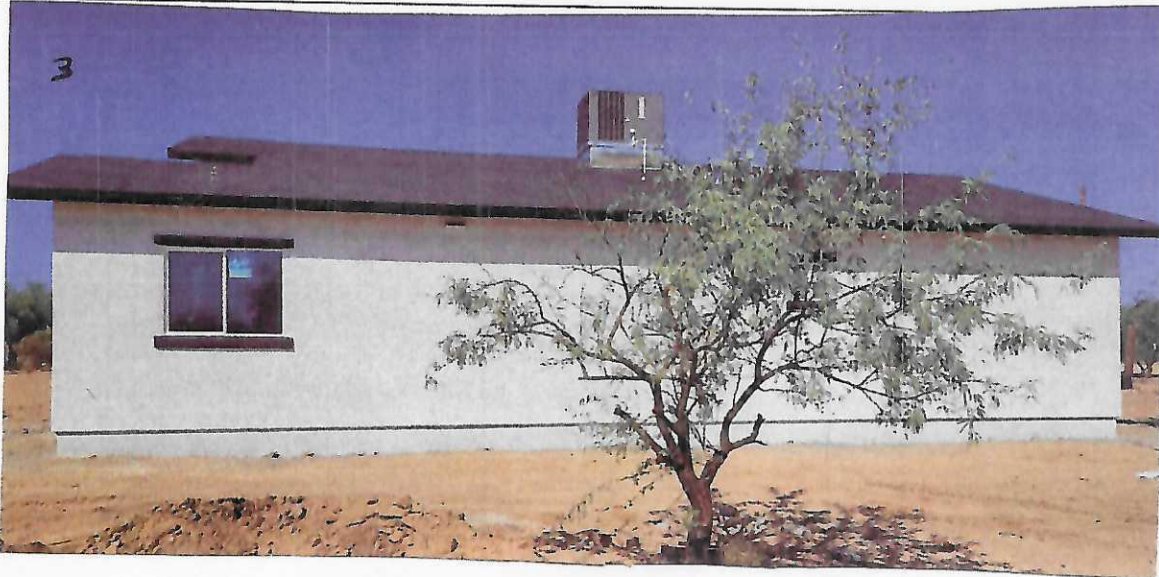
Right Side (E. Side looking W.) 9/13/2024

Insert the third and fourth photographs below. Identify all photographs with the date taken and "Front View," "Rear View," "Right Side View," or "Left Side View." When flood openings are present, include at least one close-up photograph of representative flood openings or vents, as indicated in Sections A8 and A9.