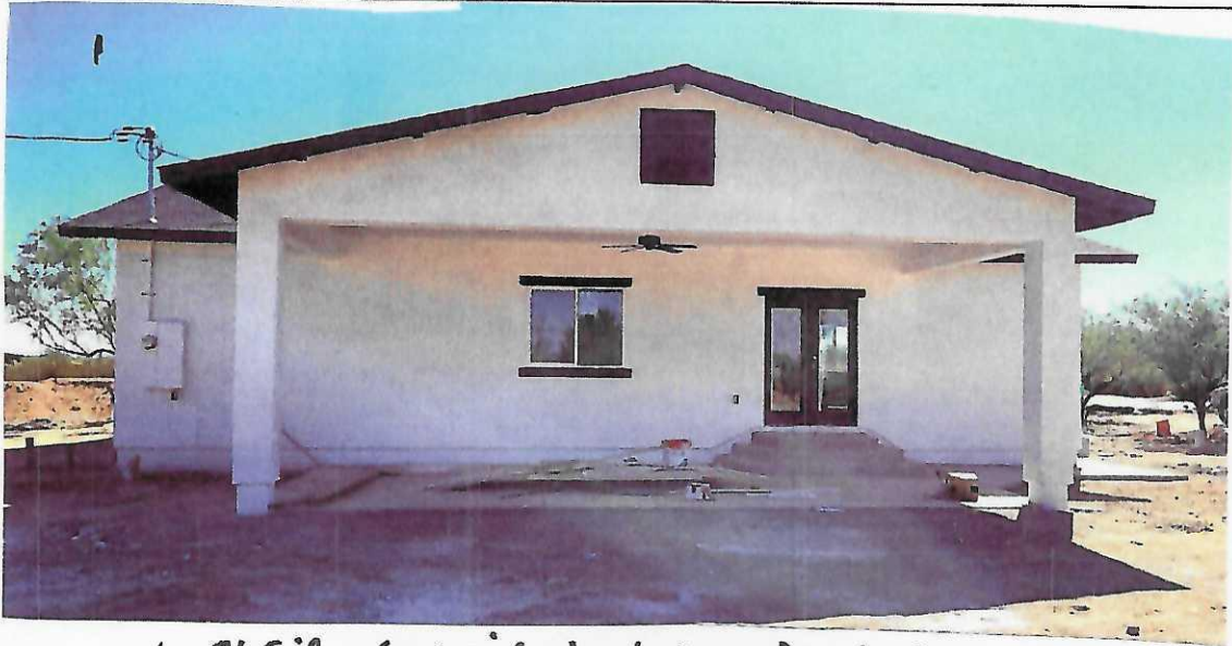
Left Side (W. Side looking E.) 9/13/2024

Instructions: Insert below at least two and when possible four photographs showing each side of the building (for example, may only be able to take front and back pictures of townhouses/rowhouses). Identify all photographs with the date taken and "Front View," "Rear View," "Right Side View," or "Left Side View." Photographs must show the foundation. When flood openings are present, include at least one close-up photograph of representative flood openings or vents, as indicated in Sections A8 and A9.