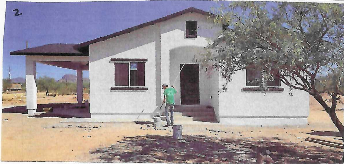
Front Side (So. Side looking N.) 9/13/2024