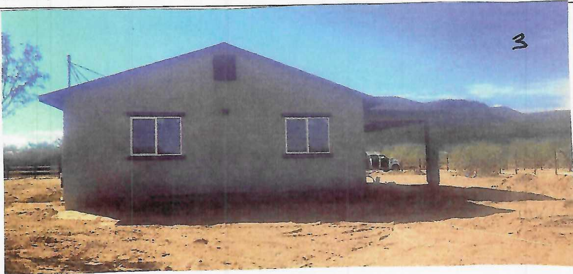
Back Side (N. Side looking So.) 10/10/2024

Instructions: Insert below at least two and when possible four photographs showing each side of the building (for example, may only be able to take front and back pictures of townhouses/rowhouses). Identify all photographs with the date taken and "Front View," "Rear View," "Right Side View," or "Left Side View." Photographs must show the foundation. When flood openings are present, include at least one close-up photograph of representative flood openings or vents, as indicated in Sections A8 and A9.