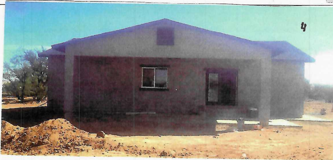
Left Side (W. Side looking E.) 10/10/2024