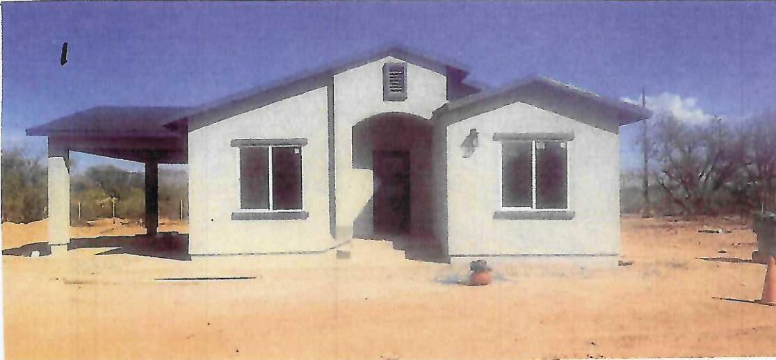
Front View (So. Side looking N.) 10/10/2024

Insert the third and fourth photographs below. Identify all photographs with the date taken and "Front View," "Rear View," "Right Side View," or "Left Side View." When flood openings are present, include at least one close-up photograph of representative flood openings or vents, as indicated in Sections A8 and A9.