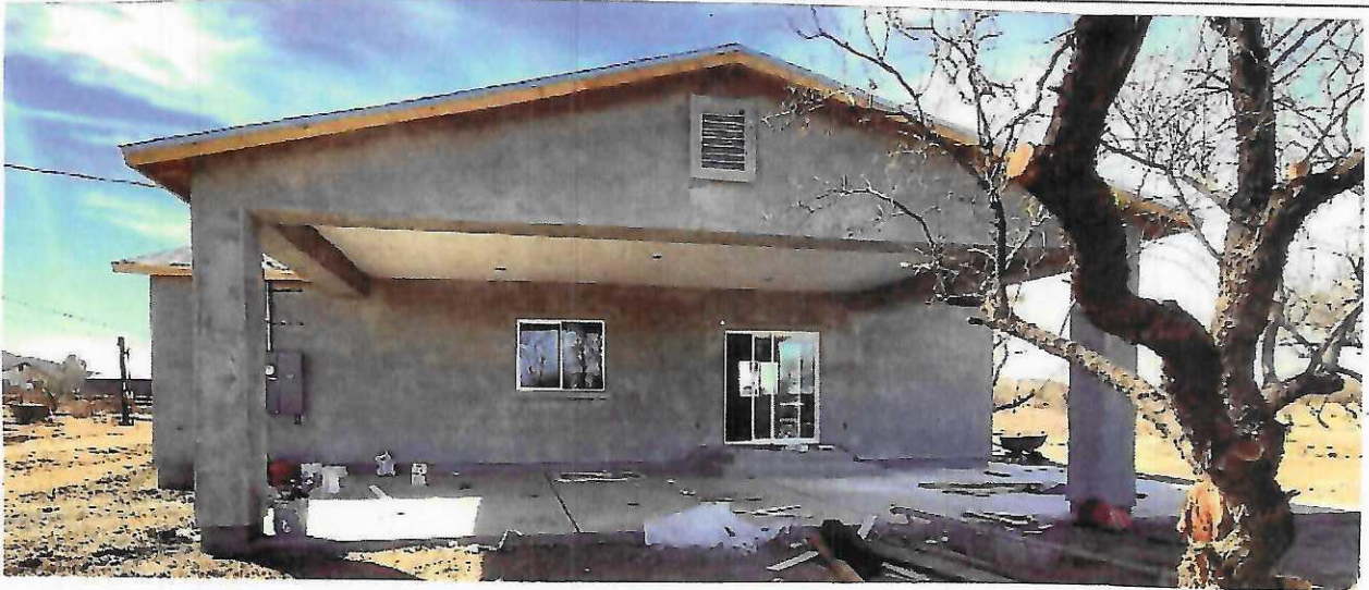
Left side unit 3 (E. Side looking W.) 2/28/2025