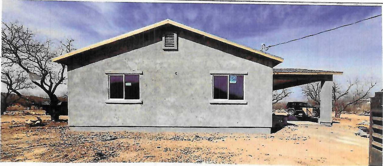
Back side unit 3 (S. Side looking N.) 2/28/2025

Insert the third and fourth photographs below. Identify all photographs with the date taken and "Front View," "Rear View," "Right Side View," or "Left Side View." When flood openings are present, include at least one close-up photograph of representative flood openings or vents, as indicated in Sections A8 and A9.