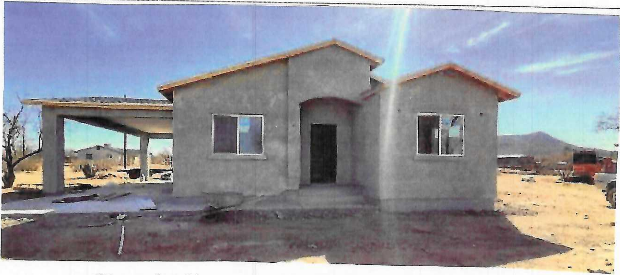
Front Side Unit 3 (N. Side looking So.) 2/28/2025

Instructions: Insert below at least two and when possible four photographs showing each side of the building (for example, may only be able to take front and back pictures of townhouses/rowhouses). Identify all photographs with the date taken and "Front View," "Rear View," "Right Side View," or "Left Side View." Photographs must show the foundation. When flood openings are present, include at least one close-up photograph of representative flood openings or vents, as indicated in Sections A8 and A9.