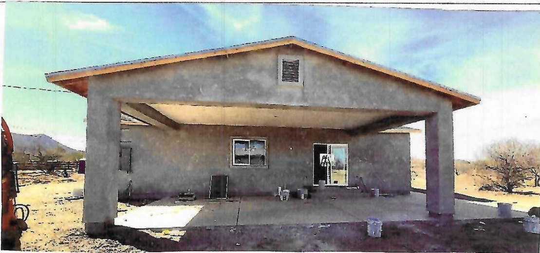
Left Side Unit 2 (E. Side looking W.) 2/28/2025