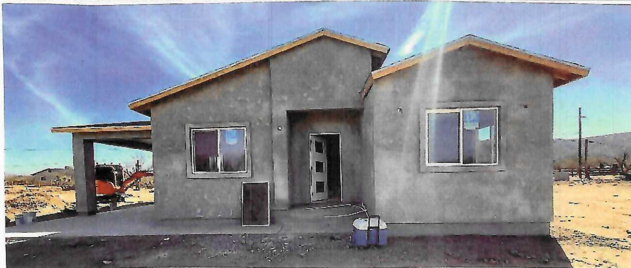
Front Side Unit 2 (N. Side looking So.) 2/28/2025

Instructions: Insert below at least two and when possible four photographs showing each side of the building (for example, may only be able to take front and back pictures of townhouses/rowhouses). Identify all photographs with the date taken and "Front View," "Rear View," "Right Side View," or "Left Side View." Photographs must show the foundation. When flood openings are present, include at least one close-up photograph of representative flood openings or vents, as indicated in Sections A8 and A9.