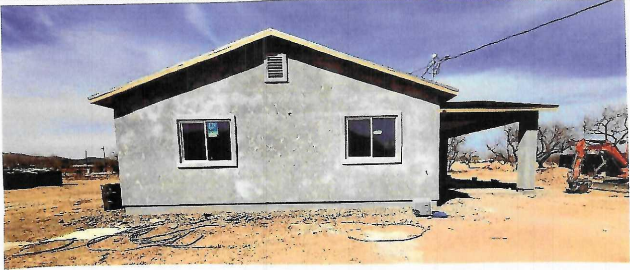
Back Side Unit 2 (So. Side looking N.) 2/28/2025

Insert the third and fourth photographs below. Identify all photographs with the date taken and "Front View," "Rear View," "Right Side View," or "Left Side View." When flood openings are present, include at least one close-up photograph of representative flood openings or vents, as indicated in Sections A8 and A9.