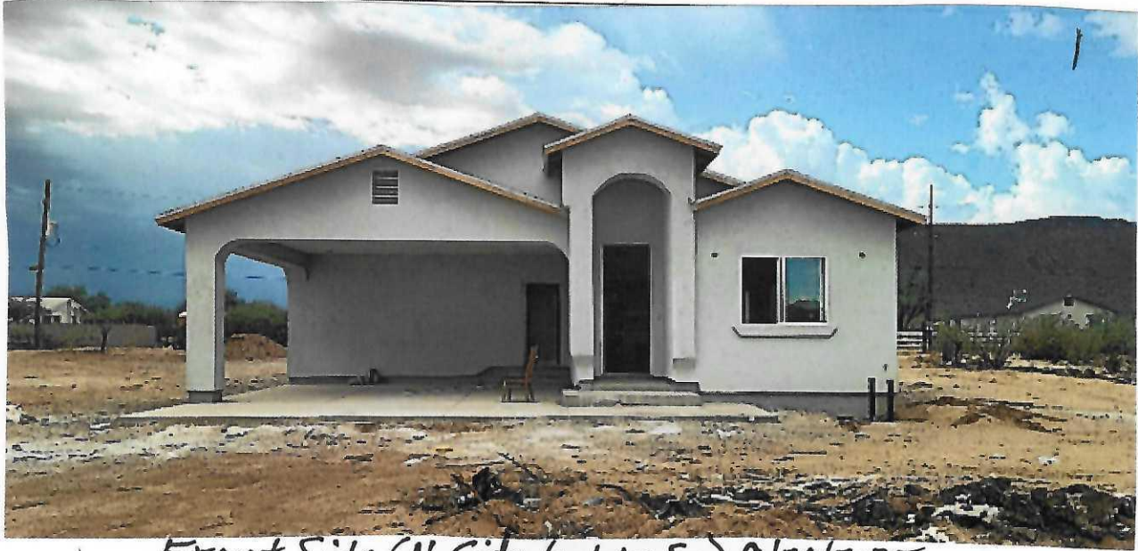
Front Side (N. Side looking So) 9/26/2025 Photo One

Instructions: Insert below at least two and when possible four photographs showing each side of the building (for example, may only be able to take front and back pictures of townhouses/rowhouses). Identify all photographs with the date taken and "Front View," "Rear View," "Right Side View," or "Left Side View." Photographs must show the foundation. When flood openings are present, include at least one close-up photograph of representative flood openings or vents, as indicated in Sections A8 and A9.