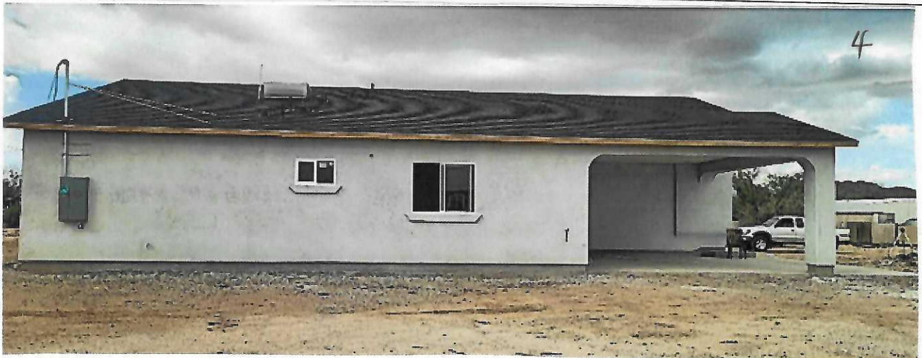
Left Side (E. Side looking W) 9/26/2025