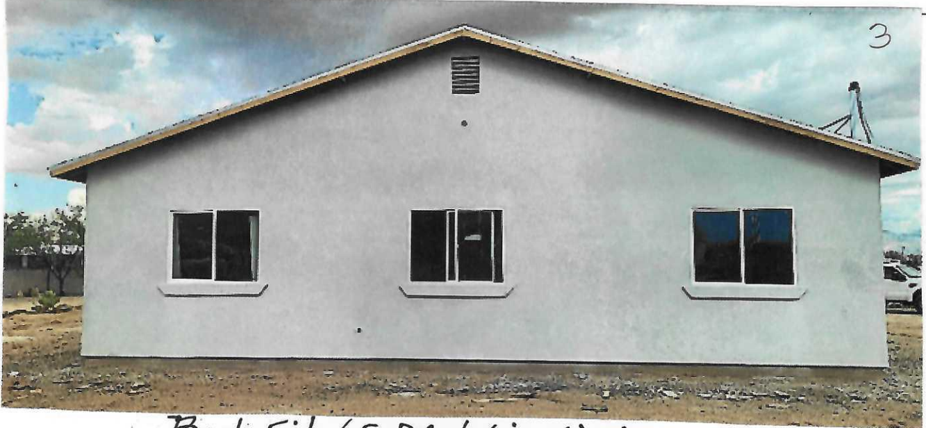
Back Side (So. Side looking N.) 9/24/2025

Insert the third and fourth photographs below. Identify all photographs with the date taken and "Front View," "Rear View," "Right Side View," or "Left Side View." When flood openings are present, include at least one close-up photograph of representative flood openings or vents, as indicated in Sections A8 and A9.