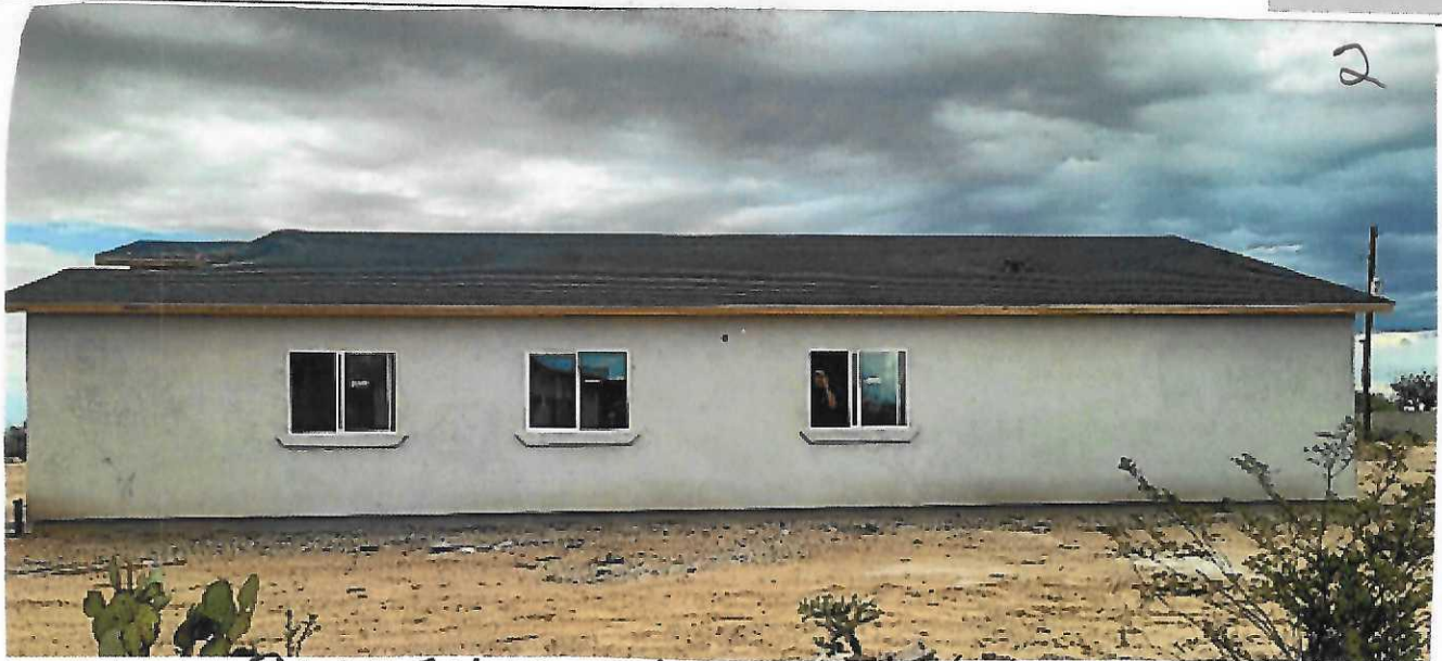
Right Side (W. Side looking E) 9/26/2025 Photo Two