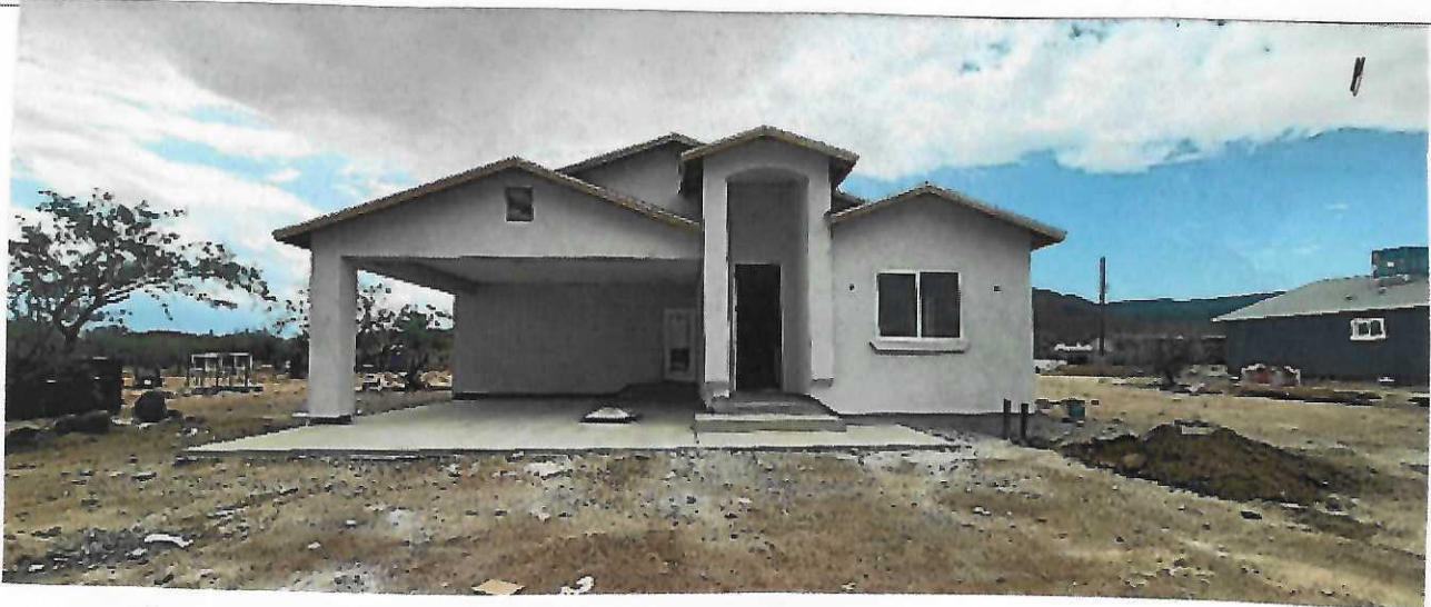
Front Side (N. Side looking So.) 9/26/2025

Instructions: Insert below at least two and when possible four photographs showing each side of the building (for example, may only be able to take front and back pictures of townhouses/rowhouses). Identify all photographs with the date taken and "Front View," "Rear View," "Right Side View," or "Left Side View." Photographs must show the foundation. When flood openings are present, include at least one close-up photograph of representative flood openings or vents, as indicated in Sections A8 and A9.