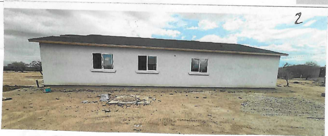
Right Side (W. Side looking E) 9/26/2025