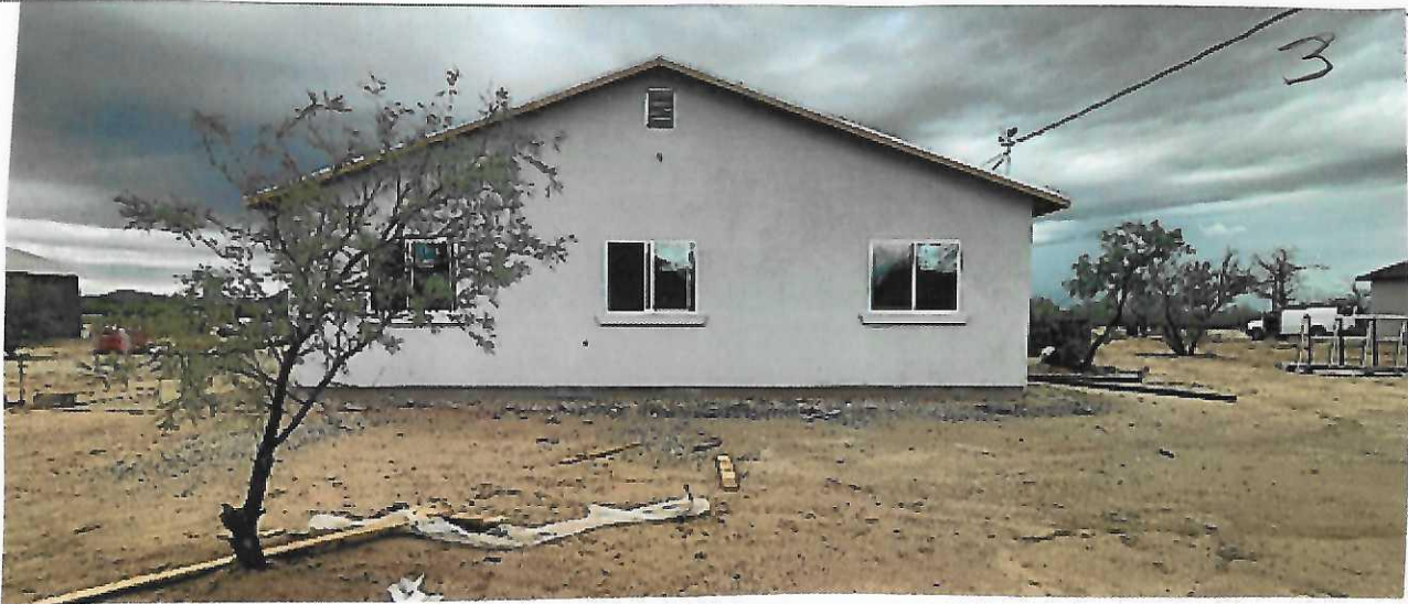
Back Side (So. Side looking N.) 9/26/2025

Insert the third and fourth photographs below. Identify all photographs with the date taken and "Front View," "Rear View," "Right Side View," or "Left Side View." When flood openings are present, include at least one close-up photograph of representative flood openings or vents, as indicated in Sections A8 and A9.