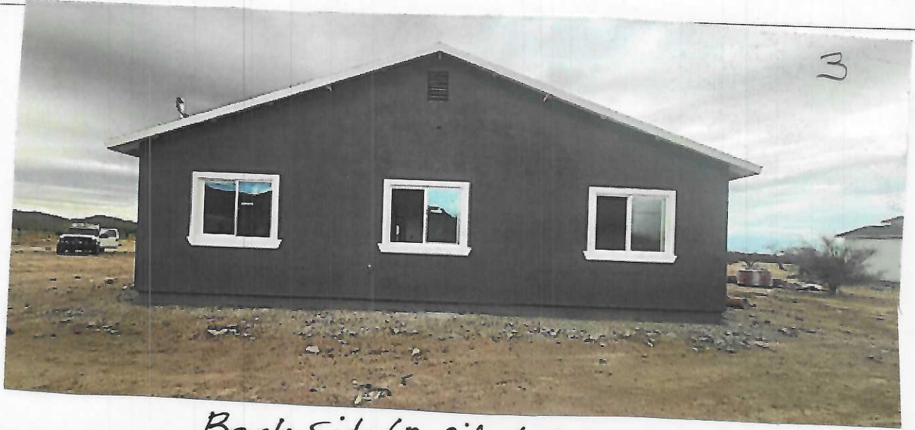
Back side (So. Side looking N) 9/26/2025

Insert the third and fourth photographs below. Identify all photographs with the date taken and "Front View," "Rear View," "Right Side View," or "Left Side View." When flood openings are present, include at least one close-up photograph of representative flood openings or vents, as indicated in Sections A8 and A9.