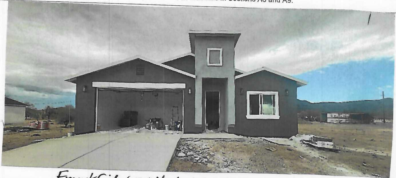
Front Side (N-Side looking S) 9/24/2025

Instructions: Insert below at least two and when possible four photographs showing each side of the building (for example, may only be able to take front and back pictures of townhouses/rowhouses). Identify all photographs with the date taken and "Front View," "Rear View," "Right Side View," or "Left Side View." Photographs must show the foundation. When flood openings are present, include at least one close-up photograph of representative flood openings or vents, as indicated in Sections A8 and A9.