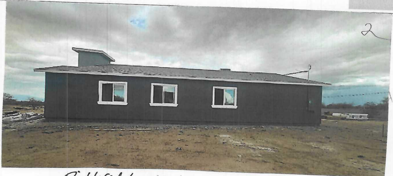
Right Side (W. Side looking E.) 9/24/2025