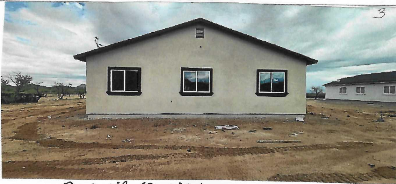
Back side (So. Side looking N) 9/26/2025

Insert the third and fourth photographs below. Identify all photographs with the date taken and "Front View," "Rear View," "Right Side View," or "Left Side View." When flood openings are present, include at least one close-up photograph of representative flood openings or vents, as indicated in Sections A8 and A9.