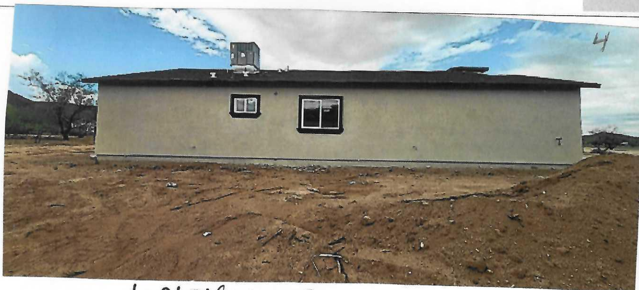
Left side (E. Side looking W.) 9/26/2025