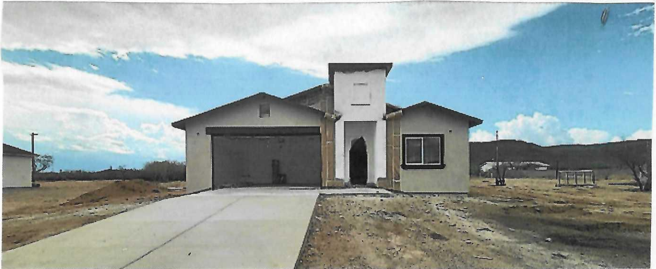
Front Side (N. Side looking So.) 9/24/2025 Photo One

Instructions: Insert below at least two and when possible four photographs showing each side of the building (for example, may only be able to take front and back pictures of townhouses/rowhouses). Identify all photographs with the date taken and "Front View," "Rear View," "Right Side View," or "Left Side View." Photographs must show the foundation. When flood openings are present, include at least one close-up photograph of representative flood openings or vents, as indicated in Sections A8 and A9.