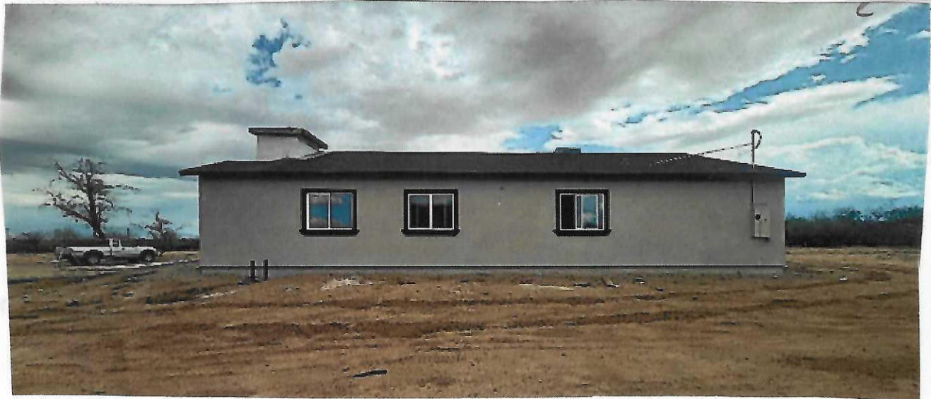
Right Side (W. Side looking E.) 9/24/2025 Photo Two