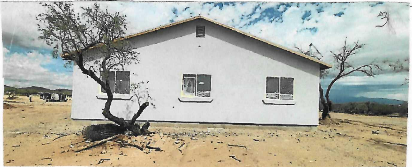
Back Side (So. Side looking N.) 9/26/2025

Insert the third and fourth photographs below. Identify all photographs with the date taken and "Front View," "Rear View," "Right Side View," or "Left Side View." When flood openings are present, include at least one close-up photograph of representative flood openings or vents, as indicated in Sections A8 and A9.