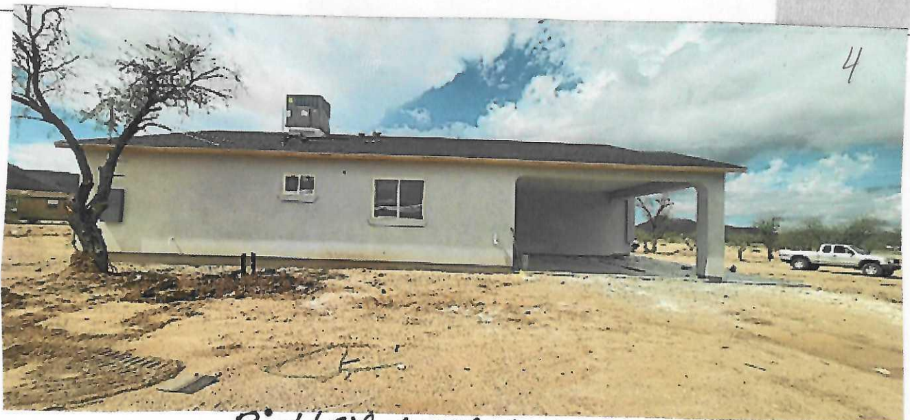
Right Side (E. Side looking W.) 9/24/2025