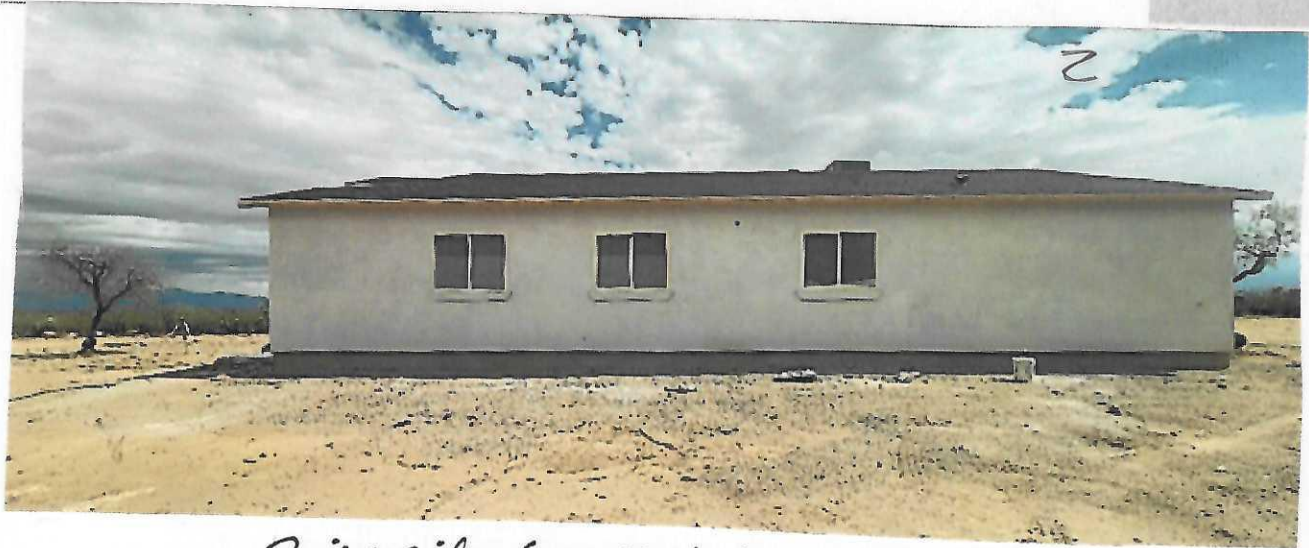
Right Side (W. Side looking E.) 9/26/2025