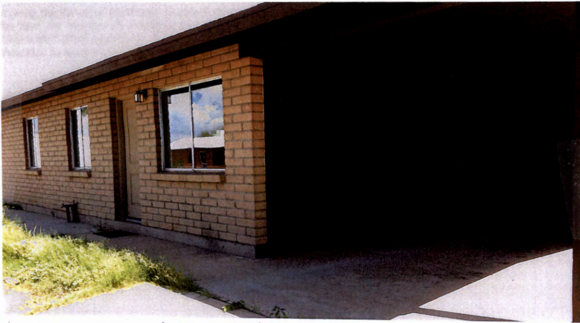
NORTH (FRONT) SEE PAGE 4