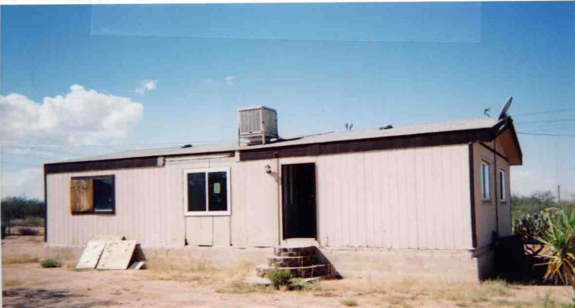
Front View 10/21/11

If using the Elevation Certificate to obtain NFIP flood insurance, affix at least Four building photographs below according to the instructions for Item A6. Identify all photographs with: date taken; "Front View" and "Rear View"; and, if required, "Right Side View" and "Left Side View." If submitting more photographs than will fit on this page, use the Continuation Page on the reverse.