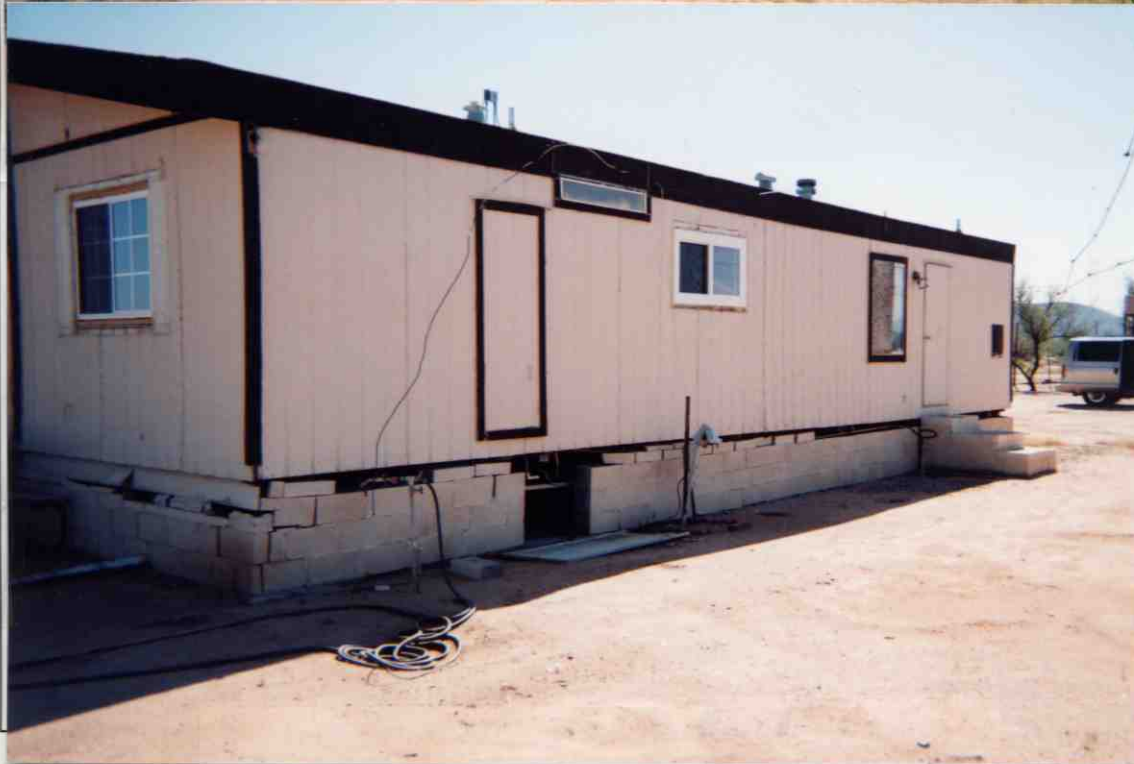
Rear View 10/21/11