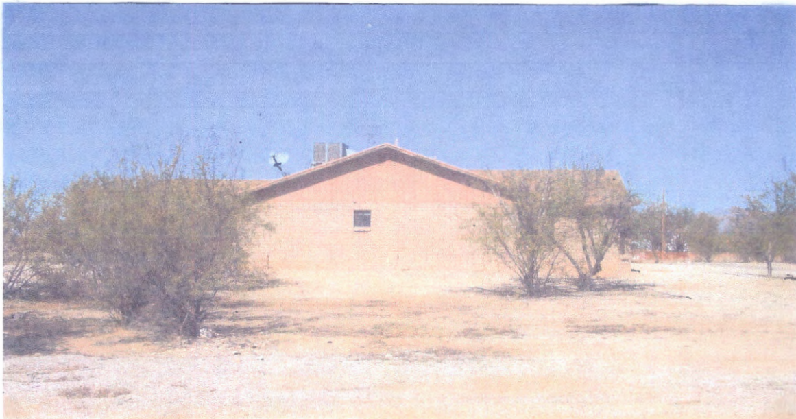
LEFT SIDE VIEW — SOUTH — 1-2-12