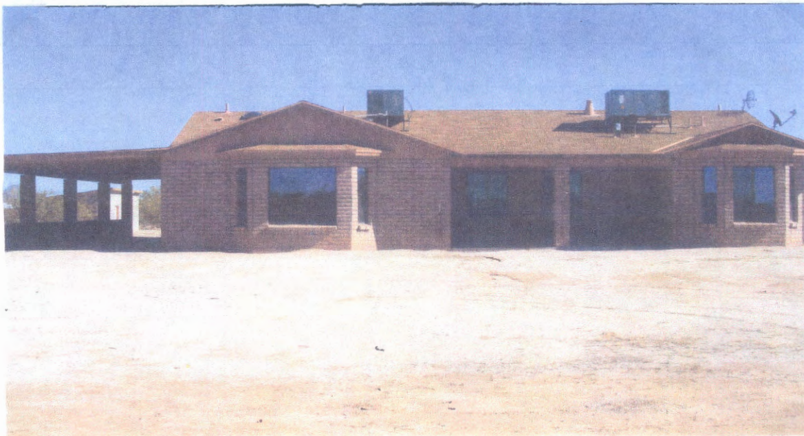
REAR VIEW — WEST — 1-2-12

If submitting more photographs than will fit on the preceding page, affix the additional photographs below. Identify all photographs with: date taken; "Front View" and "Rear View"; and, if required, "Right Side View" and "Left Side View."