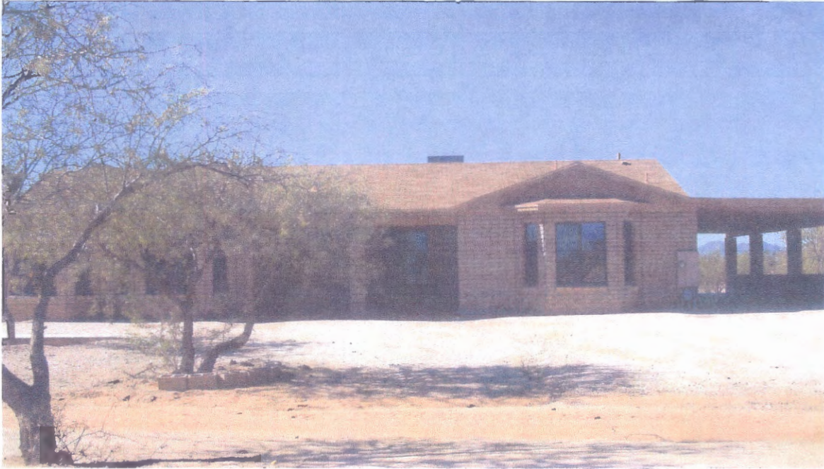
FRONT VIEW — EAST — 1-2-12

If using the Elevation Certificate to obtain NFIP flood insurance, affix at least building photographs below according to the instructions for Item A6. Identify all photographs with: date taken; "Front View" and "Rear View"; and, if required, "Right Side View" and "Left Side View." If submitting more photographs than will fit on this page, use the Continuation Page on the reverse.