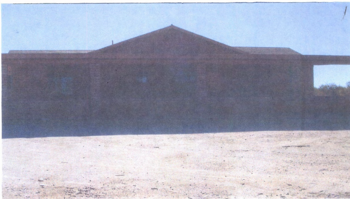
RIGHT SIDE VIEW — NORTH — 1-2-12