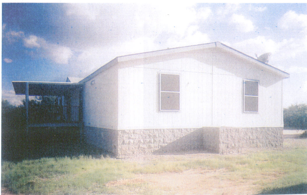
Right side (North)

If using the Elevation Certificate to obtain NFIP flood insurance, affix at least Four building photographs below according to the instructions for Item A6. Identify all photographs with: date taken; "Front View" and "Rear View"; and, if required, "Right Side View" and "Left Side View." If submitting more photographs than will fit on this page, use the Continuation Page, following.