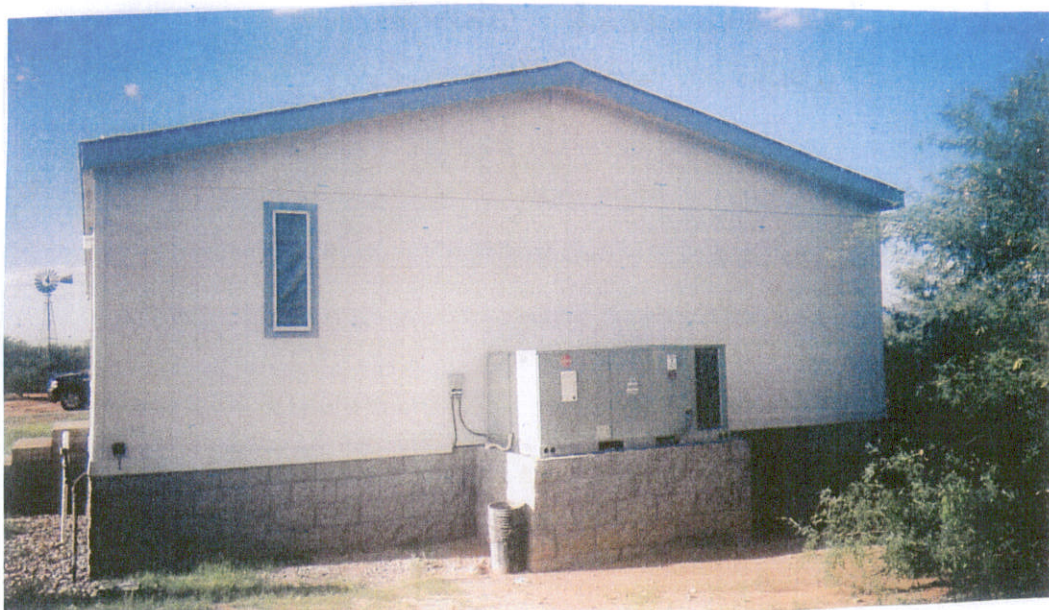
Left side (South)