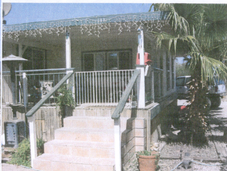
Back (North) side