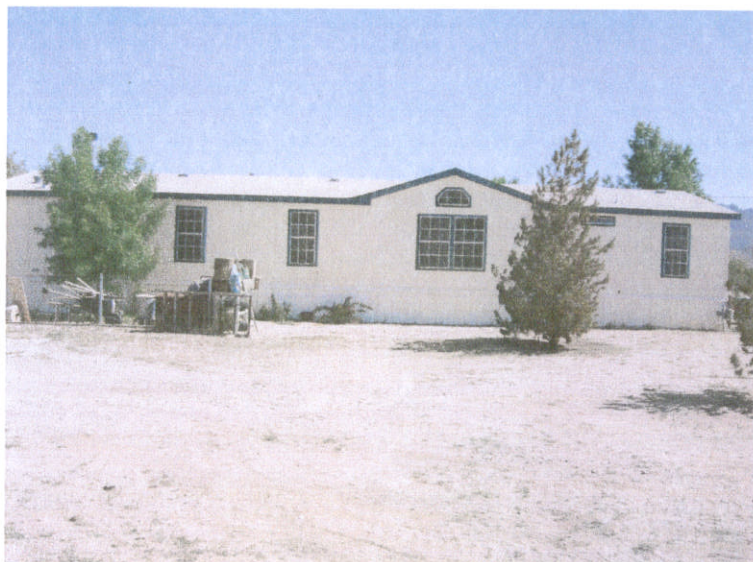
Front (South) view