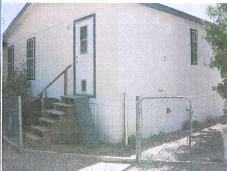
Left (West) view