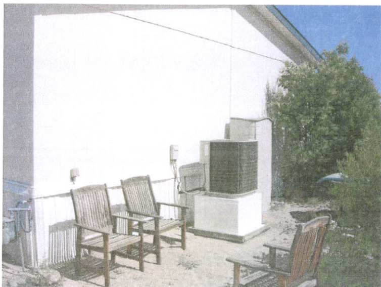
Right (East) view